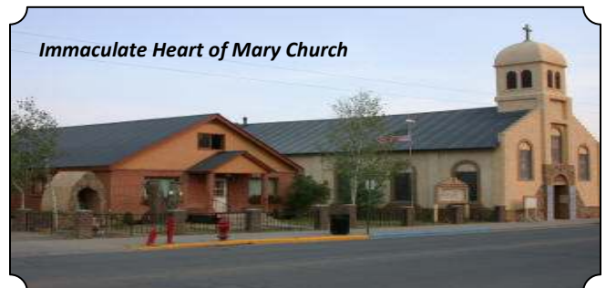
Immaculate Heart of Mary Church

353 South Pagosa Boulevard, Pagosa Springs, CO 81147