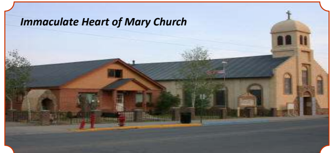
Immaculate Heart of Mary Church

353 South Pagosa Boulevard, Pagosa Springs, CO 81147